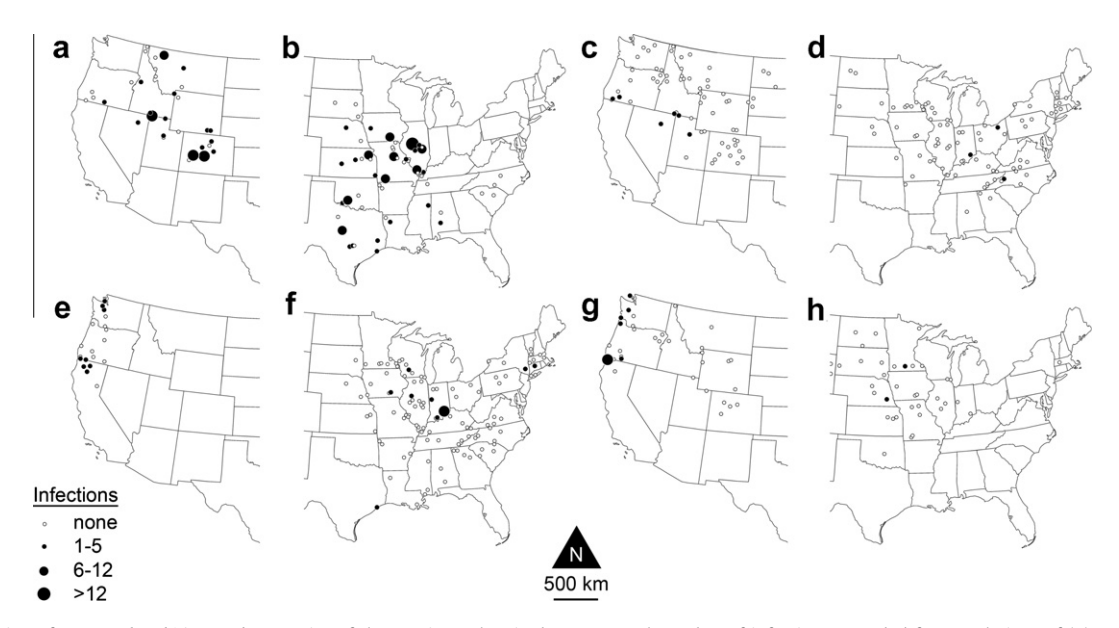
Fig. 2. Distribution of Nosema bombi in Bombus species of the continental United States. Total number of infections recorded for populations of (a) B. occidentalis, (b) B. pensylvanicus, (c) B. bifarius, (d) B. bimaculatus, (e) B. vosnesenskii, (f) B. impatiens, (g) B. mixtus, and (h) B. griseocollis.

The mature infective spores of N. bombi are slightly elongate oval. Frequent observation of empty spores in the tissue smears indicated intracellular germination (Solter and Maddox, 1998; Cali and Takvorian, 1999). Under light microscopy (400 \times) , mature spores are identical in shape to those found in European bees (Fries